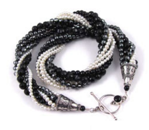
Permanent Twist Multi-Strand Necklace S6 Did you ever wonder how those "twisty" necklaces that you see in the catalogs keep their permanent twist? Learn the secret in this

class. Using flex wire and crimps, you can make a 3 to 6 strand necklace with a permanent twist.