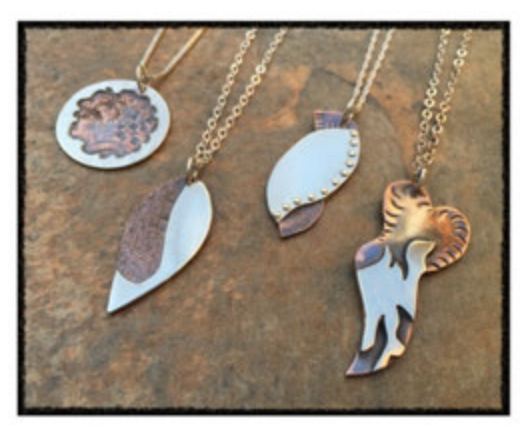
Soldering II with Charles No Sweat Sweat Soldering M2

May 28 Sat. 10:00-3:00 $85.00 Charles Agel, instructor/$25* supply fee, payable to instructor on day of class.