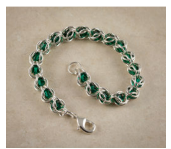
Crystal and Chain Maille Bracelet CM2

Apr. 17 Sun. 12:00-3:00 $35.00 Mardi Trout, instructor/Kit fee of $30 payable to instructor on day of class.