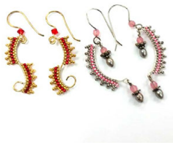
Brick Stitch on Wire SB1

Learn to bead directly onto wire. Make earrings or a pendant using brick stitch, picot and a little wire wrapping. Instructor will supply wire armatures. Apr. 16 Sat. 10:00-1:00 $35.00 Lisa Norris, instructor