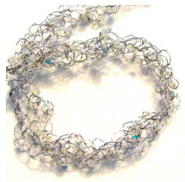
Crocheting with Wire WW2

Learn the very simple way to create this complex-looking necklace. Students will use fine-gauge wire, a bead soup mix, and a crochet hook. Student must have some familiarity with basic crochet techniques. May 1 Sun. 12:00-3:00 $35.00 Betty Sloan, instructor