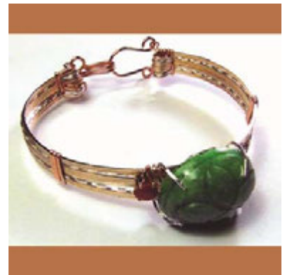
Wired Bracelet with Cabochon Accent7 Make a wire bracelet with a deep cabochon set atop the bracelet and a faceted gemstone accent. June 5 Sun. 12:00-4:00 $45.00 Sue Lindsey, instructor/Wire kits available.

May 30 Mon. 2:00-6:00 $45.00 Sue Lindsey, instructor/Kit fee $25 (includes 5 pieces of sea glass and the wire you need to make 5 pieces and round wire to make the connectors between pieces.) $25.00 If you have sea glass you have collected, bring your pieces with you.