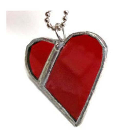
Stained Glass Heart Pendant G3

Are you ready for the garden parties this spring and summer? Have a little fun with stained glass and learn to cut, grind, layer, wrap with copper foil and solder. Add a few colorful leaves, flowers, and even a bug along with your own personal sentiments too, to create your own one of kind colorful pendant. June 17 Fri. 10:00-2:00 $45.00 Kim Joy, instructor/Supply kit $25: stained glass, foil, lead-free solder. All other tools will be available for use during class.