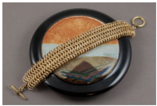
8-into-1 Chain Maille Bracelet CM1

Learn the 8-in-1 Chainmaille weave that also uses two different size rings. The smaller sized rings are used to create some gathering to cause the bracelet to curve slightly on the edges. This is an advanced class. Students may not complete the bracelet in class but will be able to complete the bracelet on their own. Some knowledge of chainmaille is recommended. Kits are available in jewelry brass.