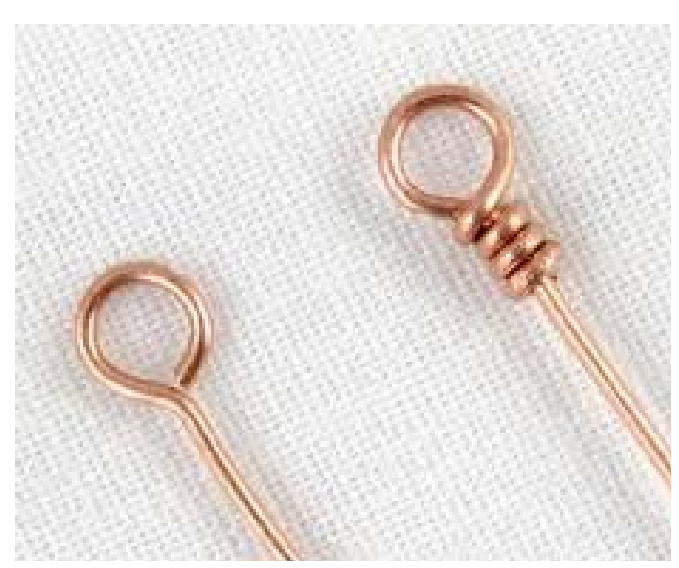
The Perfect Wire Wrap WW3

Learn the very simple way to create this complex-looking necklace. Students will use fine-gauge wire, a bead soup mix, and a crochet hook. Student must have some familiarity with basic crochet techniques. May 1 Sun. 12:00-3:00 $35.00 Betty Sloan, instructor