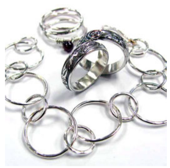
Soldering I with Charles Rings of Fire M1

Students must be 18 or older to participate in metal working classes due to the equipment and chemicals used.