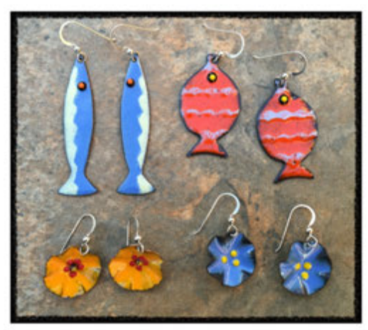
Torch Fired Enamels II Fish & Flowers M4

The art of enameling is laborious and purchasing a kiln is expensive. Torch-fired enamels is a great way to add color to your metal projects without the expense. We will make a variety of findings and objects that you can use in your other jewelry projects as well as a ring, bracelet or pair of earrings. May 21 Sat. 10:00-3:00 $55.00 Charles Agel, instructor/$35* supply fee, payable to instructor on day of class.