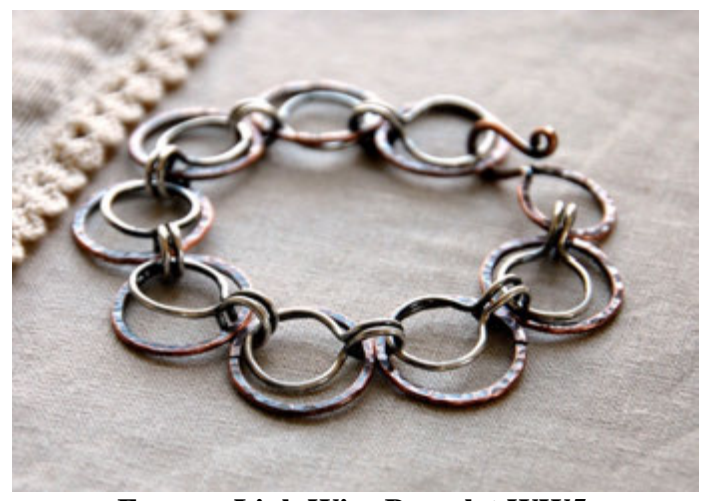
Forever Link Wire Bracelet WW5

Cindy Wimmer, instructor/$18 supply fee payable to instructor on day of class