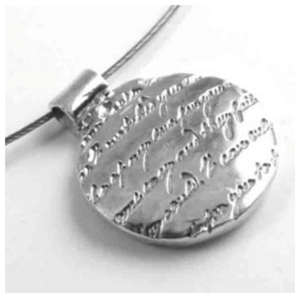
PMC: Domes PMC2

or give as a gift. Pieces will be fired at Kim's studio and returned to Stars Beads for pick-up May 27 Fri. 10:00-2:00 $45.00 Kim Joy, instructor/ PMC 3 16 gm available at market price (approximately, $38) payable to instructor on day of class.