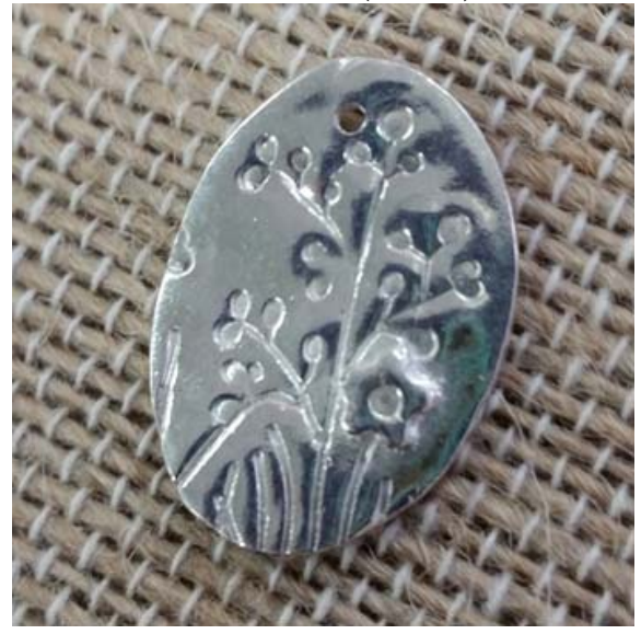
PMC with Stamps PMC1

Using PMC 3 you will design a pendant which will be textured with stamps to give antique look to a classic pendant. This will be a one of a kind pendant that you can wear for yourself