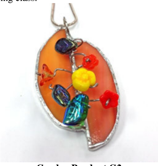
Garden Pendant G2

Kim Joy, instructor/Supply kit $25: stained glass, foil, lead-free solder. All other tools will be available for use during class.