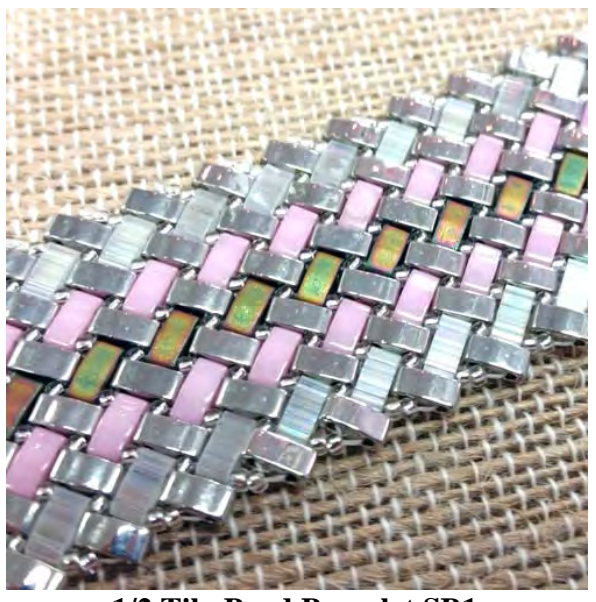
1/2 Tila Bead Bracelet SB1 Using 2 hole half tilas and seed beads you will create a sumptuous bracelet. Once you make one, you'll

Adding glass to your PMC pendant make for wonderful one of a kind pieces. You can use any kind of fusible glass, we will be using dichroic cabs. Tools will be available for classroom use.Pieces will be fired at Kim's studio and returned to Stars Beads for pick-up. Aug 14 Sun. 12:00-4:00 $45.00 Kim Joy, instructor/ Dichroic Cabs ($1.30) and PMC 3 20 gm available at market price (approximately, $45) payable to instructor on day of class.