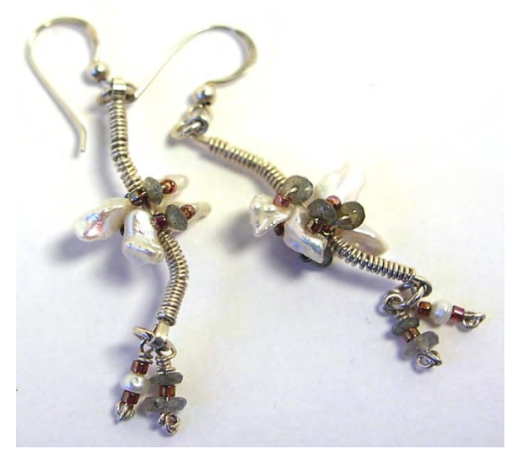
Pearly Wraps WW4

Susan Lindsey, instructor/ Kit fee: $20 for brass or copper wire; $35 for Argentium silver wire, payable to instructor on day of class