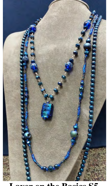
Layer on the Basics S5 Layering necklaces is a current, popular fashion statement. Using basic stringing and wire-working techniques, design a series of

necklaces that can be worn together or separately. Learn two basic stringing techniques, as well as learning to make necklaces using wire loops and chain.