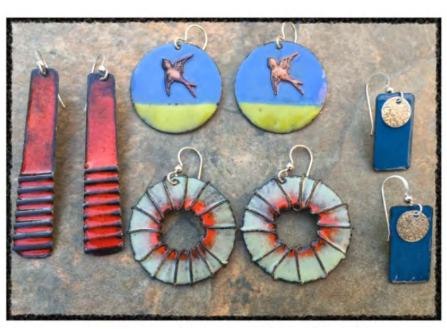
Torch Fired Enamels Painting With Fire M3

Sweat soldering is a simple process used extensively in making jewelry attach or layer various sheet metals to achieve 3D effects in your jewelry. We will create a mixed metal pendant from sterling silver and copper. Soldering I is recommended but not required. Sept 25 Sat. 10:00-3:00 $85.00 Charles Agel, instructor/$25* supply fee, payable to instructor on day of class.